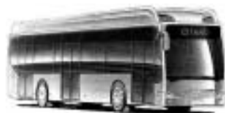
One of the hydrogen powered buses that will be trialled in Perth

This is an exciting project for Perth. It is expected that the buses will be in service towards the end of 2004.